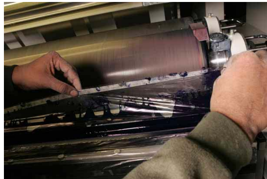
Ink will build up on the wrap, not on the doctor blade holder.

After printing, carefully remove the Chamber Wrap blade with all the mess. Be amazed with clean doctor blade holder and the time you just saved going to the next job!