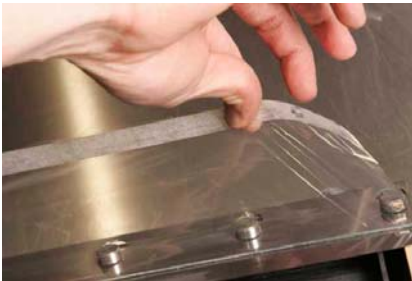
Doctor blade in clamp.