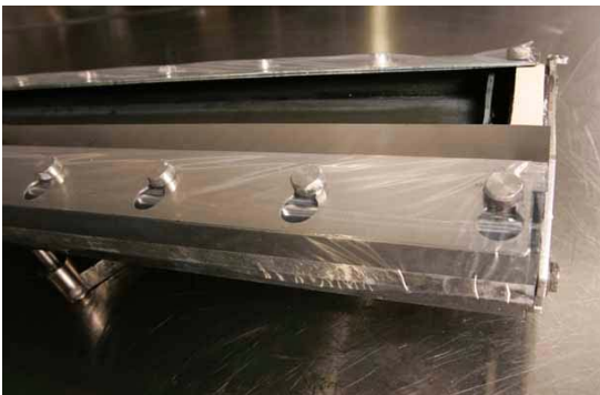
Chamber is protected with plastic covering.